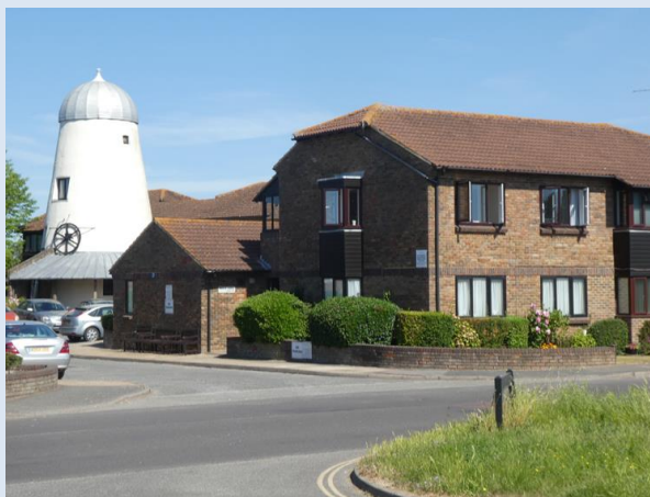
Entrance to Nyetimber Mill